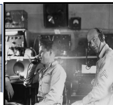
20th Fighter Group