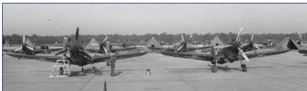
The 20th Fighter Group's P-40s at Esler Field

To address our deficiencies a series of maneuvers were held in the fall of 1941. In September the 20th deployed to Esler Field, Louisiana to take part in Louisiana Maneuvers. The maneuvers were not so much a contest as they were an experiment. Some of the deficiencies discovered were: equipment breakdowns; failure to lead from the front; shortage of repair crews; uncoordinated attacks; poorly worded orders and jumbled